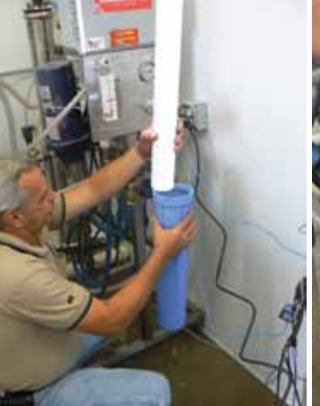
Take out the old filter and swap with a new one.