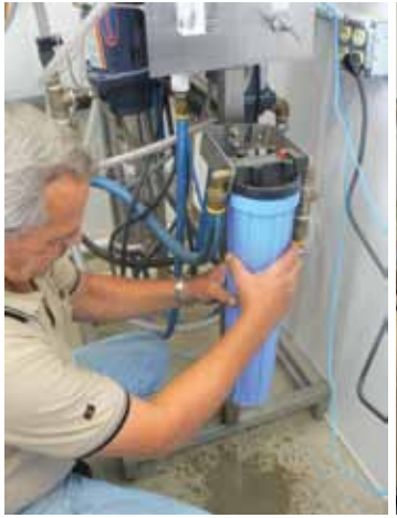
Unscrew the PreFilter counter clockwise until it comes off. You may need to use a wrench or hammer to get it started.

Tools you will need: 2½ Plyers Plumber's Wrench