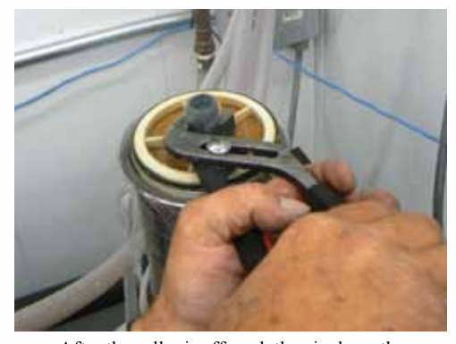
After the collar is off, grab the nipple on the filter with your plumber's plyers and turn and pull at the same time.