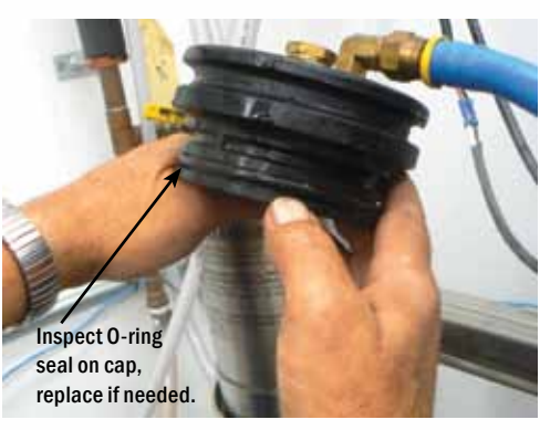
Before placing the cap back on, check the O-ring seal on the cap and replace if needed.